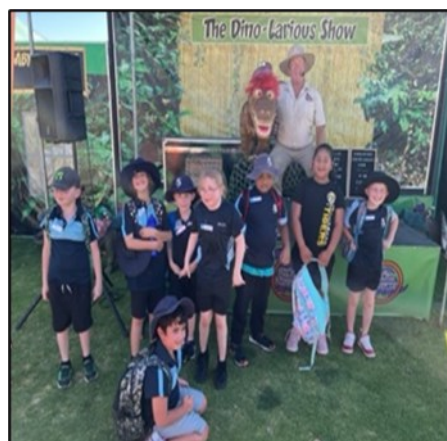
During the Mildura Show excursion, Room Two students watched the Dino Man and had a photo with him.