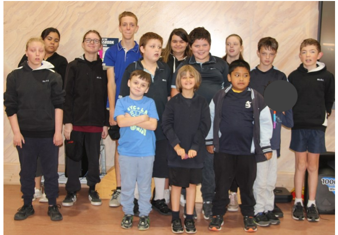
Mildura Show 2023 – Student Second Prize Awards