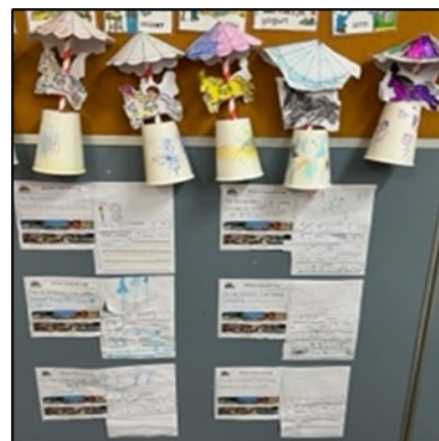
Room Two makeshift carousels and Mildura Show writing.