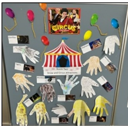
Room Two Circus hand animals.