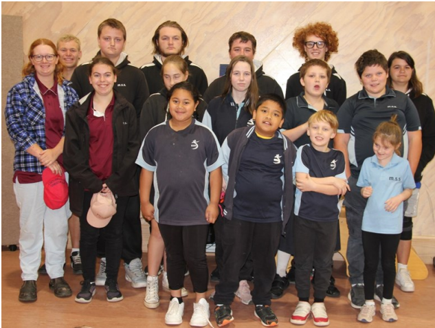
Mildura Show 2023 – Student First Prize Awards