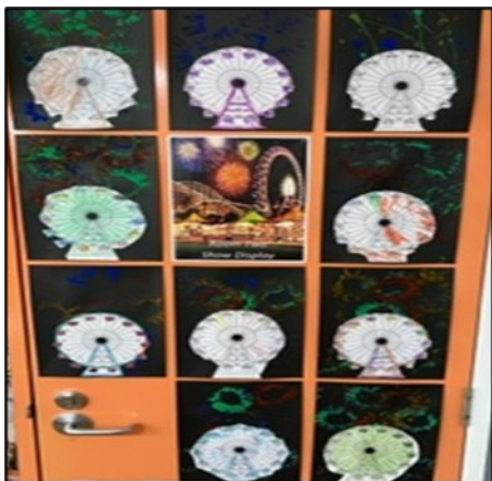
Room Two fireworks behind a Ferris wheel.

Early Years have been working on their Inquiry Unit called Celebrations. Room Two students have been busy creating a celebration wall collage and have also completed a range of other activities to depict how and why we celebrate. Some of the activities completed by the students so far are participating in an excursion to the Mildura Show, and learning about Diwali (The Festival of Lights). Room Two students are excited to continue their learning of the many different celebrations we celebrate for the remainder of the Term.