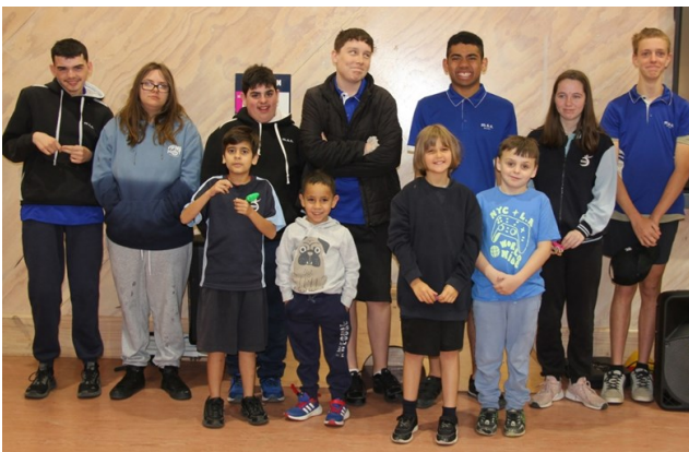
Mildura Show 2023 – Student Third Prize Awards