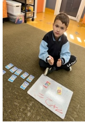
Levi using playing cards to write and solve addition problems.