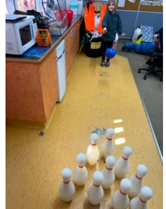
Amy getting ready to bowl and subtract her knocked down pins from 10.