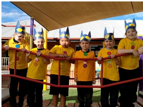
Room 1 students got dressed up as Pete the Cat for our performance of Pete's Groovy Buttons song during our end of term talent show.