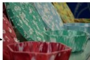
Re-made in Robe!